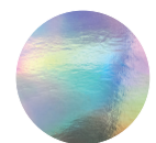
SKN D05 Iridescent metallized