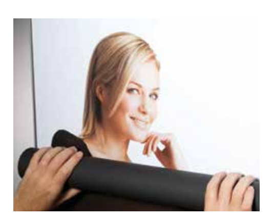
HIGH QUALITY PRINT DEFINITION