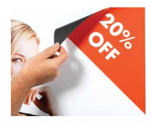
ADD OR MOVE LAYERS QUICKLY AND EASILY