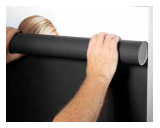
EASILY APPLIED TO THE MAGNETIC FACE